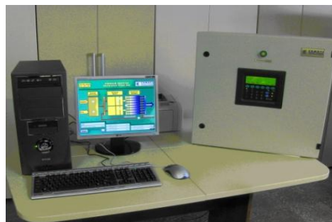
Wastewater Treatment Plant Monitoring and Control